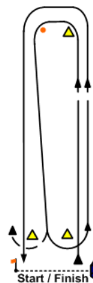
Sample Even-Leg Course

8.3. Sample course board and configurations (labels will not be displayed):